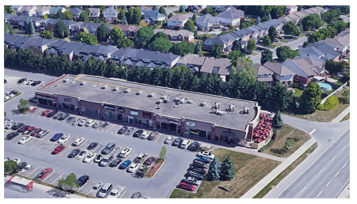
Amenity node in Riverside South, Ottawa