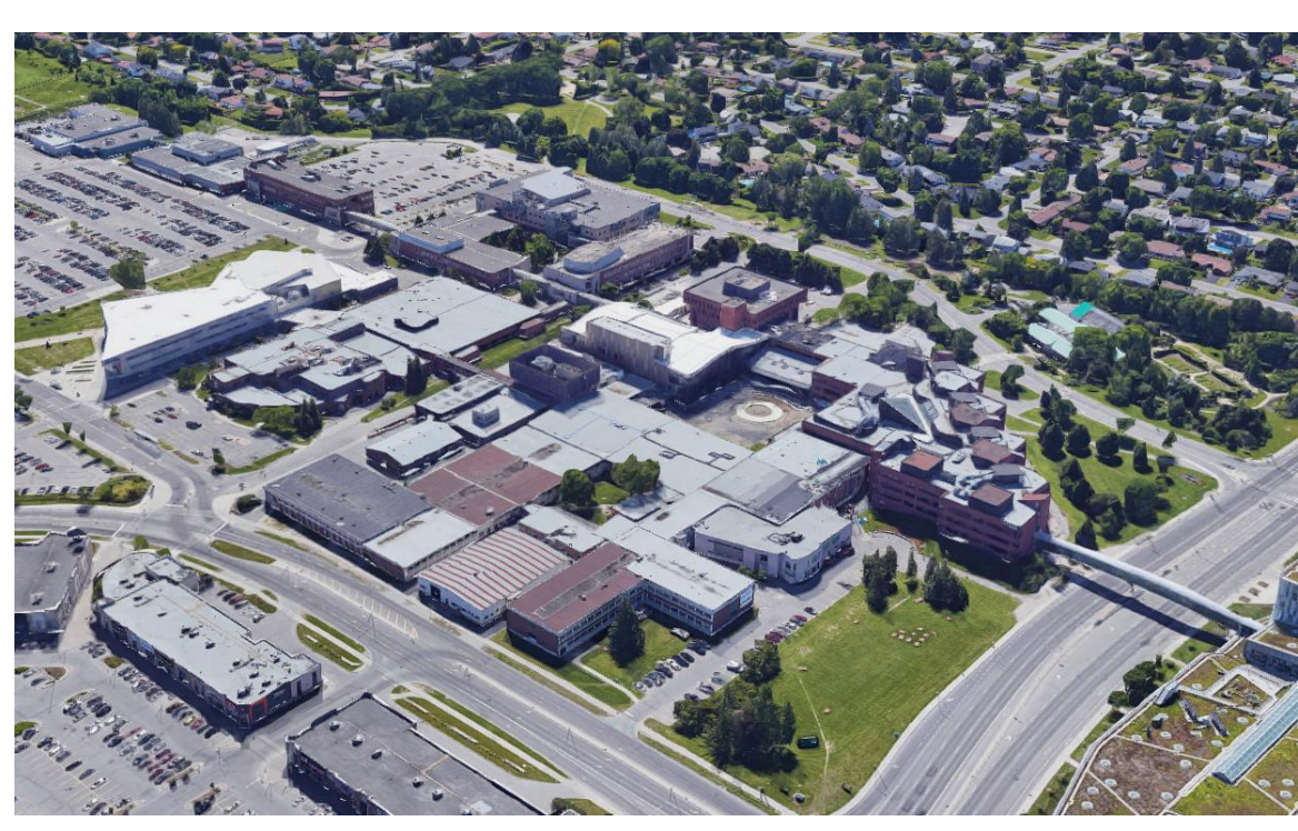
Algonquin College, Ottawa