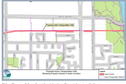
Bike Route Map for the Hydro Corridor trail that was prepared for the Transportation Committee.