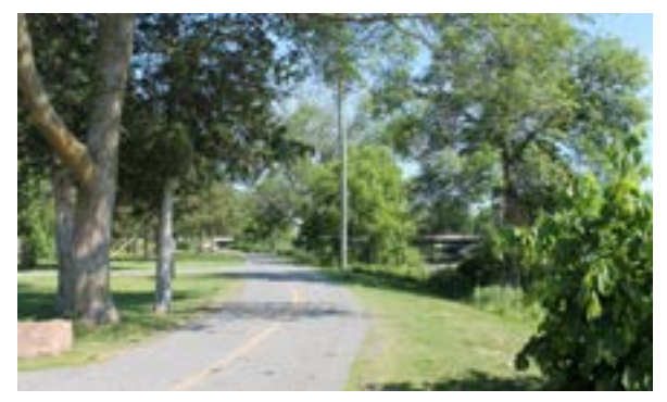
Develpment cost charges update for parks.